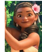
Moana's mother Sina