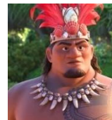
Moana's father Chief Tui