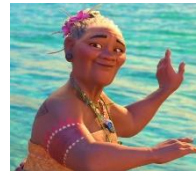
Moana's grandma Tala