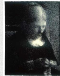
Seurat The artist's mother

Branches of this type of art include, Social Realism, Magic Realism and Hyper-Realism.