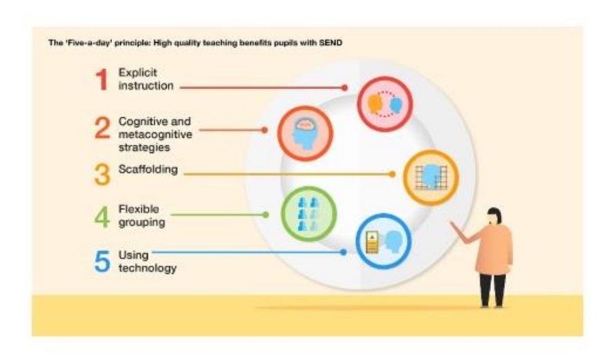
Special Educational Needs in Mainstream Schools

Inclusive high-quality teaching ensures that planning and implementation meets the needs of all pupils. At Rivelin we draw on the 'Five-a-day' principle (EEF) to ensure that all pupils have access to high-quality teaching and learning.