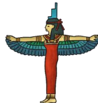
Isis Mother Goddess, Goddess of Protection and Healing